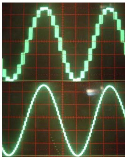
20 kHz CD TEST TONE SHOWING UPSAMPLING

free with your upsampling option. Note that the HDCD option does not work at 132 kHz so upsampling should be set for 96K when HDCD is installed.